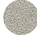
Carpet: August Grove