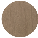
Kitchen Island Cabinets: Salt of the Earth