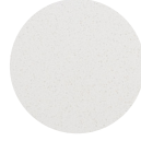
Quartz Countertops: Elegant White