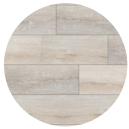
LVP: Chasing ice