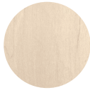
Kitchen, Ensuite & Bath Cabinets: Natural Affinity