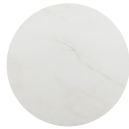
Ensuite & Bath Backsplash: Capri White Matte