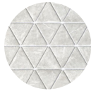
Kitchen Backsplash: Breccia