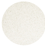
Quartz Countertops: White Rock