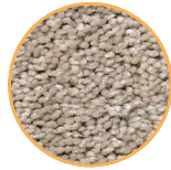
Carpet: Shifting Sand