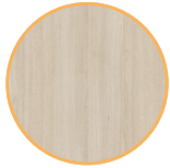
Cabinets: Free Spirit