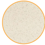
Quartz Countertops: Diavik