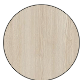
Cabinets: Free Spirit