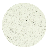
Quartz Countertops: Crystal Crescent