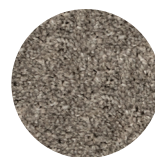
Carpet: Dragon Grey