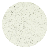
Countertops: Crystal Crescent