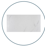
Backsplash: Eksa Atlas White