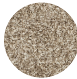
Carpet: Sand Martin