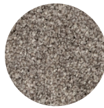
Carpet: Sand Martin