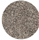
Carpet: Sand Martin