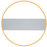
Backsplash: Island Glossy White