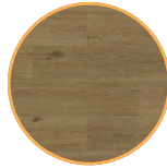
LVP: Gold Coast