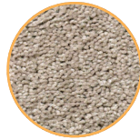
Carpet: Shifting Sand