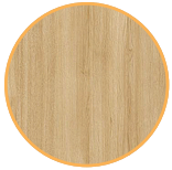
Cabinets: Sheer Beauty