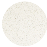
Quartz Countertops: White Rock