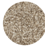
Carpet: Sand Martin