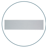
Backsplash: Eksa Island White Glossy