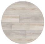
LVP: Chasing Ice