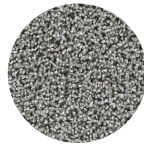
Carpet: Beach Lava