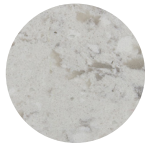
Countertops: Ivory Coast