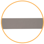
Backsplash: Dark Grey Glossy