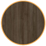
Cabinets: Light Grey